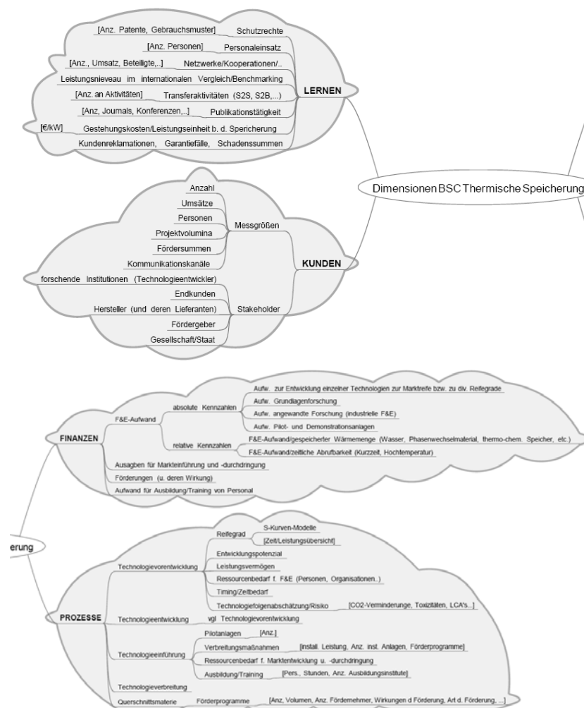
Fig. 2: Examples of indicators for the balanced scorecard “heat storage”

To use the Balanced Scorecard method for the development of a research-oriented masterplan we adapted the common tool to our specific situation. At the beginning we decided to use the four original perspectives as described above thereby restricting the idea to develop new or other perspectives, either substitutionally or additionally. We found out that even if new perspectives may have fitted better to our intention to find a methodology for controlling the development and diffusion of a masterplan we decided to use the original ones as they are well known and adjustable to our needs.