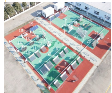
▲ Figure 2. Photos left to right: Compact system with ETC. Closed system with FPC. Testing platform at the Clean Thermal Energy Carbon Emission Test Center.