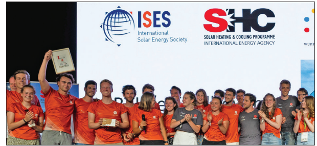
▲ Team VIRTUe of the Eindhoven University of Technology in the Netherlands.

A unique feature of the VIRTUe building was the distribution of heat and cold via the floor, where phase-change material elements were integrated to achieve a higher thermal mass. Other aspects the SHC/ISES jury noticed were that the team included only students, even for the project management, and they brought their own power container with PV modules and 120 kWh battery for the two-week construction period so that they would not need a power connection on site.