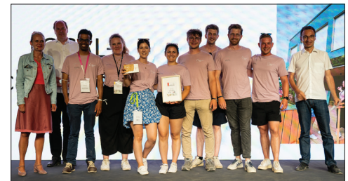
▲ Team LOCAL+ from the Aachen University of Applied Sciences with the SHC/ISES jury.

◀ The energy concept of the LOCAL+ team from the University of Applied Sciences in Aachen, Germany, uses façade-integrated PV elements (blue on the photo). These are color-coordinated with the other building materials to increase the acceptance of onsite energy production.